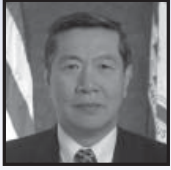
Dr. Henry Lee, Forensic Scientist *Topic: Pattern Evidence in Death Investigations

Dr. Henry C. Lee is one of the world's foremost forensic scientists. His work has made him a landmark in modern-day forensic sciences. He has been a prominent player in many of the most challenging cases of the last 50 years. Dr. Lee has worked with law enforcement agencies from 46 countries in helping to solve more than 8000 cases. Dr. Lee's testimony figured prominently in the O. J. Simpson, Jason Williams, Peterson, and Kennedy Smith trials, and in convictions of the "Woodchipper" murderer as well as thousands of other murder cases. He has assisted local and state police in their investigations of other famous crimes, such as the murder of Jon Benet Ramsey in Boulder, Colorado, the 1993 suicide of White House Counsel Vincent Foster, Kidnapping of Elizabeth Smart, Death of Chandra Levy and the reinvestigation of the Kennedy assassination.